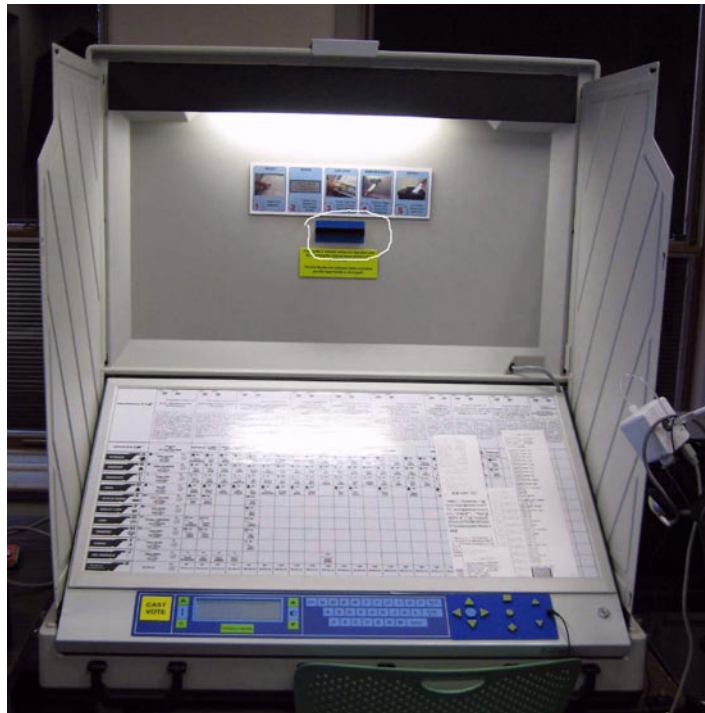
The VVPAT slot is located quite far from the voter