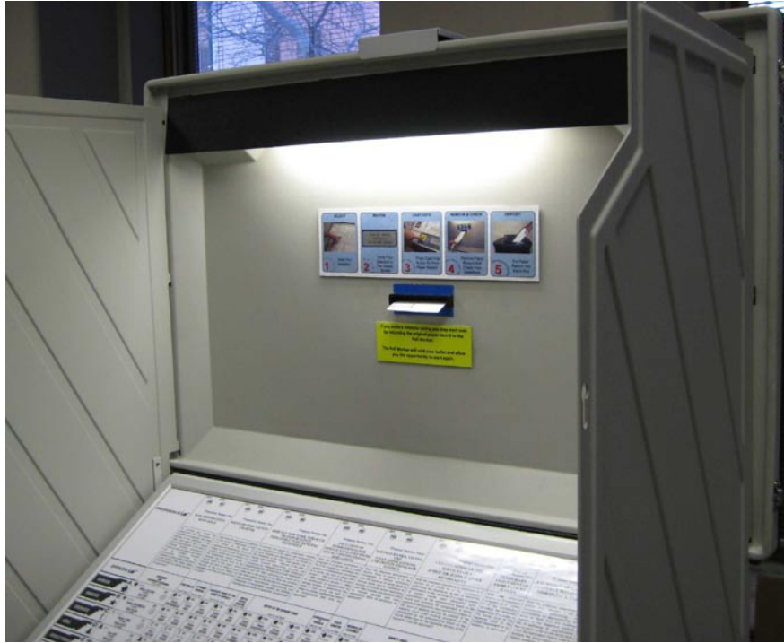
The VVPAT sticks out only about 1 inch after the voter is finished

After the voter has completed voting and presses the “Cast Vote” button, the machine pushes the VVPAT out of the slot by only 1 inch. Since the slot is located at least three feet higher than table height, a voter using a wheelchair might not be able to reach the paper.