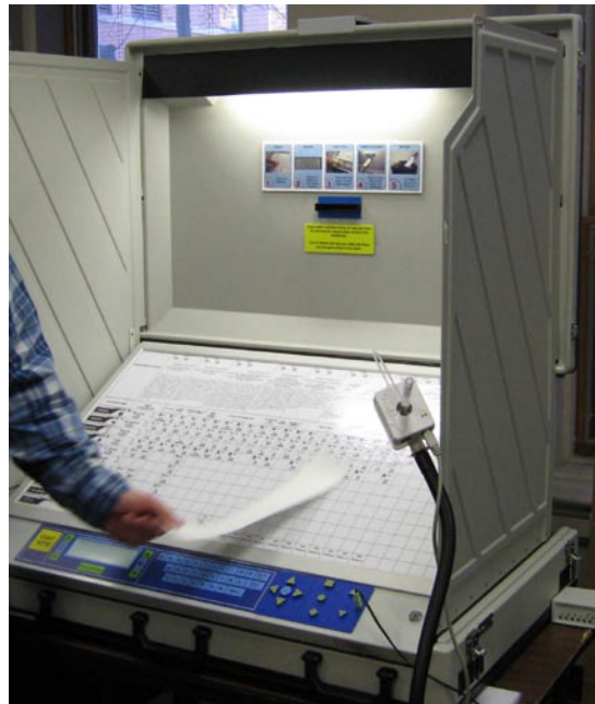
After the second press of the “Cast Vote” button, the VVPAT is ejected out the front.

In this case, if the voter presses the “Cast Vote” button a second time, the VVPAT is ejected from the slot towards the front of the machine. Since this is not guided but literally sent flying, it would be nearly impossible for many voters with disabilities to be able to catch the VVPAT as it comes out.