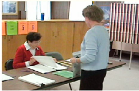
A voter walks in and registers at the check-in table.