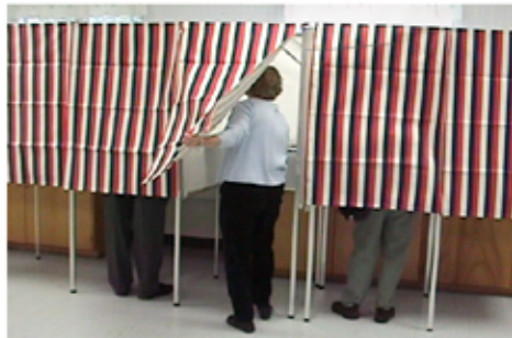
The voter enters an available marking booth to privately mark her ballot.

The voter heads for a private marking booth. A large poll site can have dozens of marking booths where many voters can mark their ballot at the same time.