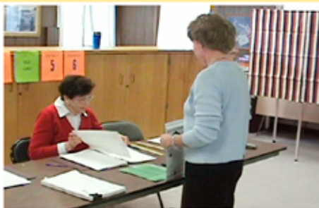
A voter walks in and registers at the check-in table.