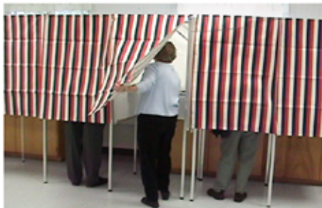
The voter enters an available marking booth to privately mark her ballot.

The voter heads for a private marking booth. A large poll site can have dozens of marking booths where many voters can mark their ballot at the same time.