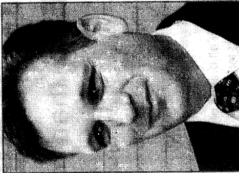
Republican Edward Mangano is leading in the recount.

"The question is whether the number of votes in the machine which are in excess of those that should be are sufficient to affect the outcome of the election. For instance, if we find 200 more votes than